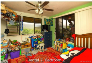
Rental 2, Bedroom 2