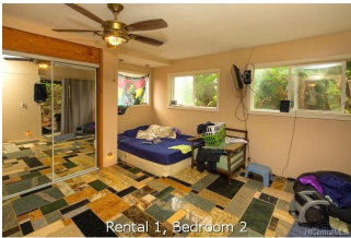
Rental 1, Bedroom 2