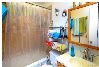
Rental 2 Bath