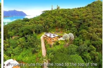
Property runs from the road to the top of the mountain.