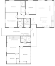
PLAN FOR THE USE OF THE BUILDING AS A COMMUNITY CENTER