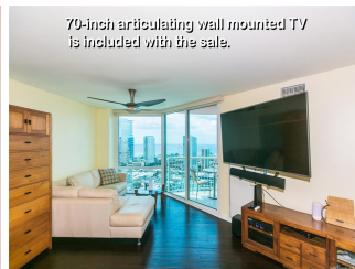
70-inch articulating wall mounted TV is included with the sale.