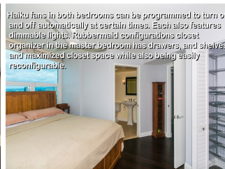
Haiku fans in both bedrooms can be programmed to turn on and off automatically at certain times. Each also features dimmable lights. Rubbermaid configurations closet organizer in the master bedroom has drawers, and shelves and maximized closet space while also being easily reconfigurable.