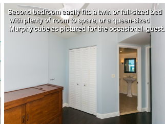
Second bedroom easily fits a twin or full-sized bed with plenty of room to spare, or a queen-sized Murphy cube as pictured for the occasional guest.