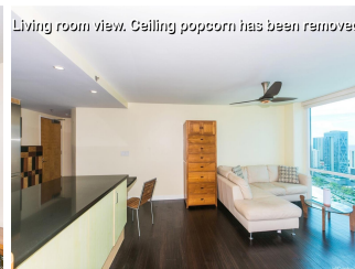
Living room view. Ceiling popcorn has been removed.