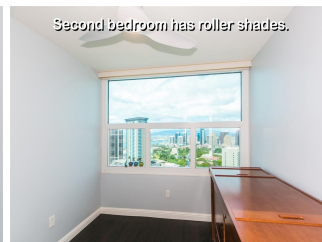
Second bedroom has roller shades.