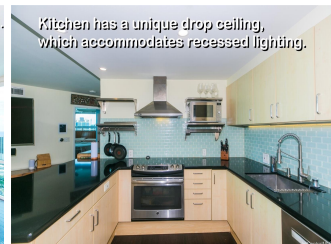
Kitchen has a unique drop ceiling, which accommodates recessed lighting.