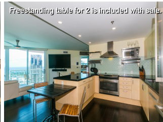
Freestanding table for 2 is included with sale.