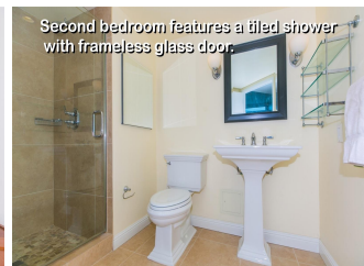
Second bedroom features a tiled shower with frameless glass door.