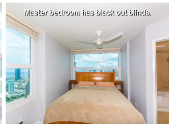
Master bedroom has black out blinds.