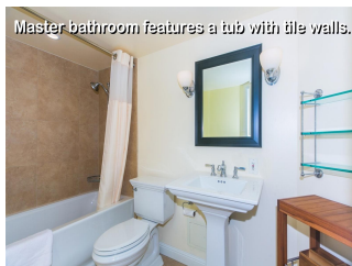
Master bathroom features a tub with tile walls.