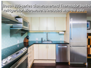
Bosch 800-series dishwasher and Thermador built-in refrigerator. Microwave is included with the sale.