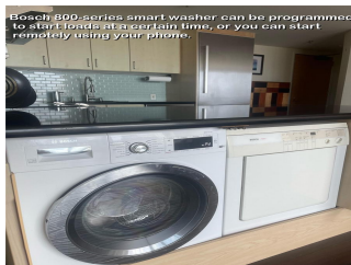
Bosch 800-series smart washer can be programmed to start loads at a certain time, or you can start remotely using your phone.