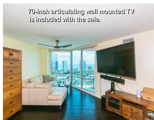
70-inch articulating wall mounted TV is included with the sale.