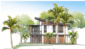
CPR-4 North Elevation