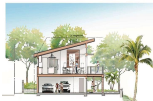
CPR-4 Cross Section Great Room / Garage / Terrace