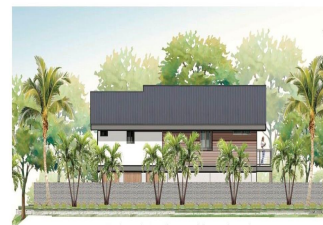
CPR-4 West Elevation - with perimeter along Kamehameha Highway