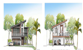
CPR-4 Day Elevation