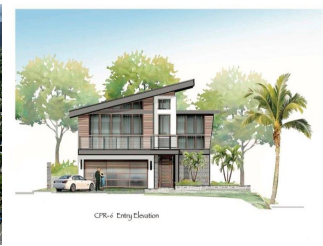
CPR-4 Entry Elevation