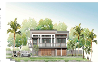
CPR-4 Mahalea Elevation