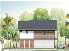
CPR-4 Mahalea Elevation